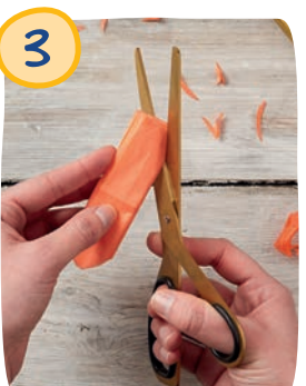
Use scissors to carefully round all four corners of your folded tissue paper stack.