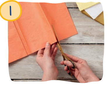
Lay five sheets of tissue paper one on top of another. Cut out a rectangle shape measuring 26cm x 11cm, to get five stacked sheets all of this size.