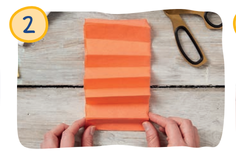
Place the tissue paper stack in front of you portrait style, and fold the bottom edge in over one inch. Flip it over and do the same on the other side, accordion-style, and repeat until you've made all possible folds.